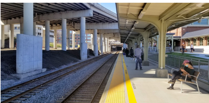
All - Bruce Becker

More Buffalo Exchange Street Station Photos At www.esparail.org