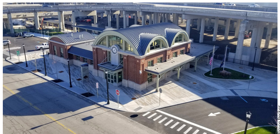
New Buffalo Exchange Street Station - More Photos On Page 10