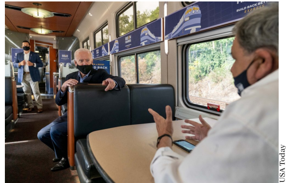
Joe Biden In A Viewliner Diner On His Recent Campaign Train

As Amtrak struggles to emerge from the COVID pandemic and find its rightful place in the nation's transportation system, the next four years under Joe Biden's leadership are certain to be of pivotal importance. Let's all hope for the best from our friend 'Amtrak Joe'!