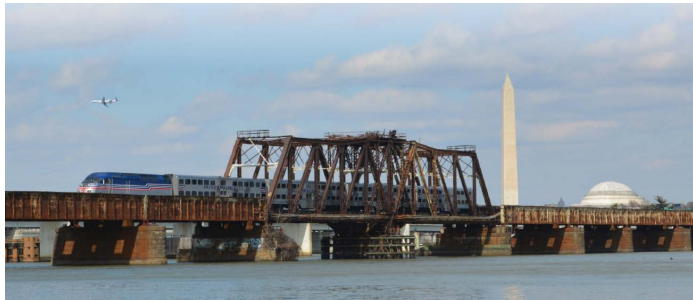
A VRE Train Crossing The Potomac River

Virginia is working with freight railroad CSX to triple track the DC-Richmond mainline while raising Amtrak speeds, removing 30 minutes from the current over 2-hours travel time, while also increasing Amtrak frequency to 15 round-trips by extending existing Boston-NYC-DC Northeast Regional trains beyond their current Washington Union Station terminus.