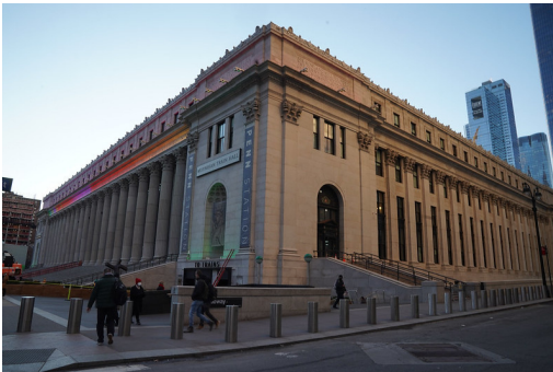
Exterior View At 33rd St. & 8th Ave.