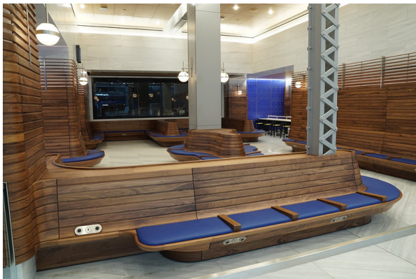
Office of the Governor

Yes, one can walk from Moynihan Train Hall directly into Penn Station, either by exiting the facility and walking across 8th Avenue or by following signage that takes one past the 8th Avenue subway entrance and then into the lobby of Penn Station. There are entrances to Moynihan Train Hall on 8th Avenue on both 31st & 33rd Streets, as well as mid-block on 31st and 33rd streets. On the Mezzanine Level, the Moynihan Train Hall also directly connects with the Post Office on 8th Avenue.