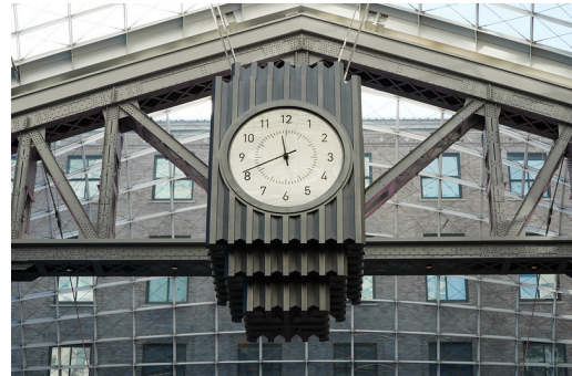
Hanging Clock In The Main Hall