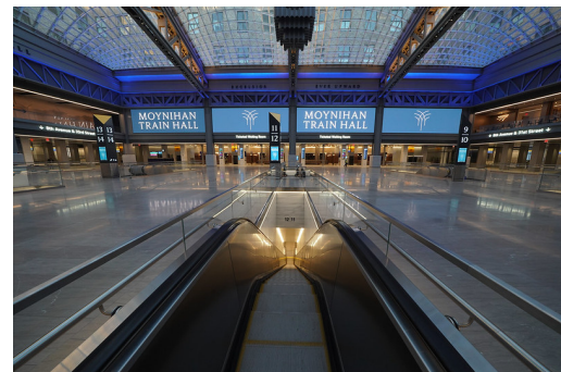
Escalator To Platform

Register NOW For The 2021 NYS Rail Advocates 'Virtual' Annual Meeting Saturday, March 13, 2021 11:00am - 3:00pm